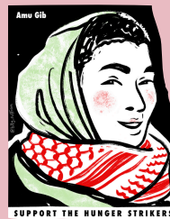
AMU GIB 50 DAYS